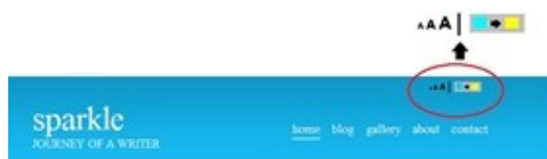
Fig. 1 Link of the Chameleon control panel in a webpage

Web page designed using Chameleon would have an icon in the right top corner of the homepage, an example of icon placed in a web page is shown in figure 1. Clicking which will lead user to a control panel. This control panel has options for customizing the design of the web pages to some extent, suppose if elderly user are suffering for using a particular web sign-up form since all the instruction are written in a very small font size. Then using this particular control panel user can change the font size to meet their requirement, in this case may be a bigger font size. Thus Chameleon allows user to alter attributes of design elements like font-face, font size, background colour and etc. Sample of the control panel is shown in figure 2.